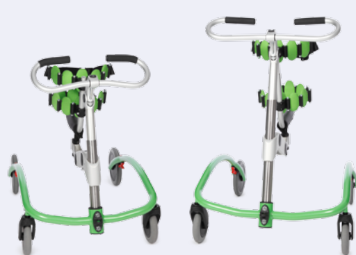
Available in two sizes