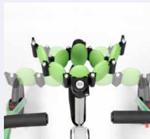
Flexible pads, individually adjustable