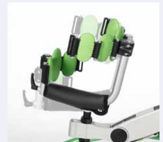
Dynamic saddle that allows the body to rotate