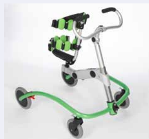
Small frame for ease of use