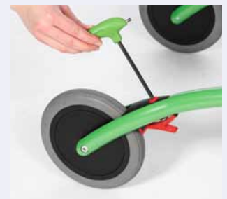
The friction brake can be adjusted easily with the enclosed tool.