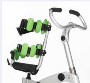
Individual adjustments, simple and straightforward