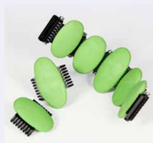
Pads can be extended individually and easy